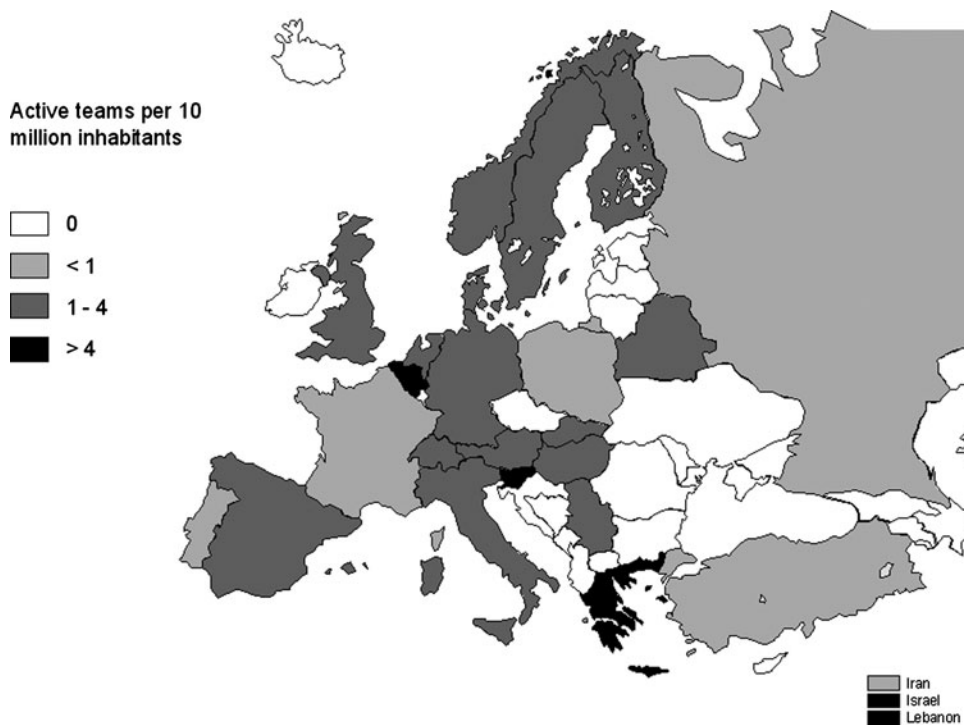
FIG. 3. Number of teams reporting novel cellular therapies in Europe in 2009 per 10 million inhabitants. Data used for this chart were derived from the extended questionnaire and the standard EBMT survey sheet.